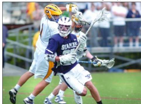
Staples Kip Orban vs. Weston on Monday.

SPORTS' PHOTOS (click on photo to view the gallery)